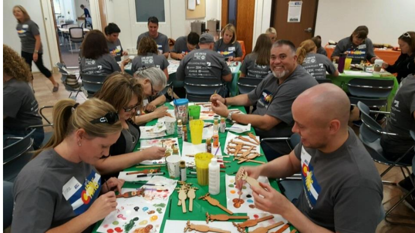
(US Bank Employees Volunteering at Meals on Wheels Day of Caring 2016)

Day of Caring is the largest, single-day volunteer effort throughout Boulder and Broomfield counties!